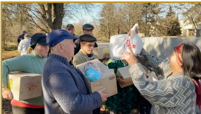
One Ukrainian villager near the war zone told our workers, "Other people flee from here, but you come to help. Thank you!"