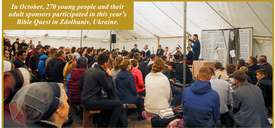
In October, 270 young people and their adult sponsors participated in this year's Bible Quest in Zdolbuniv, Ukraine.

Initially the idea of BIEM's Pavel Usach, the yearly Bible Quest is now considered BIEM's final camp for each year even though it takes place in autumn. But the Quest is different from typical teen camps. First, in order to attend, the young adults in each team must prepare themselves by intensively studying specific portions of Scriptures for many weeks long before the actual Quest. (In the past, the young people have been assigned a particular book of the Bible to study. In 2023, Quest organizers introduced an interesting twist: instead of assigning the young people a particular book, they assigned