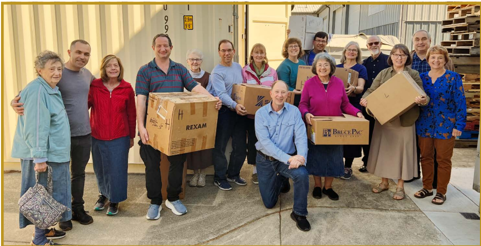
Members of Heritage Baptist Church near Chicago delivered a load of clothing, wheelchairs, walkers, crutches, and other medical supplies. They also spent the day sorting and boxing donated items. If you have such items to donate, our warehouse is ready!