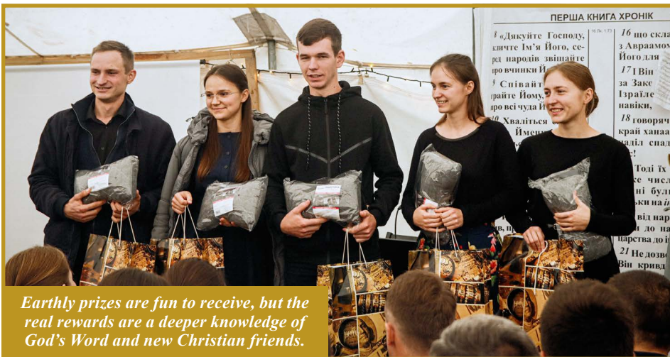
Earthly prizes are fun to receive, but the real rewards are a deeper knowledge of God's Word and new Christian friends.