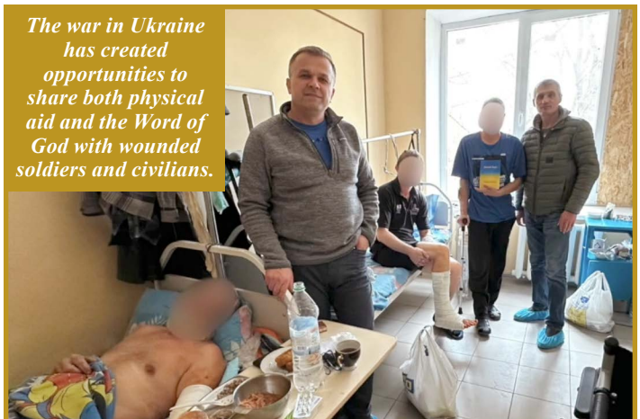
The war in Ukraine has created opportunities to share both physical aid and the Word of God with wounded soldiers and civilians.