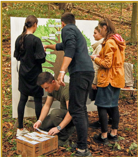
Recalling the exact sequence of David's life can be a challenge.