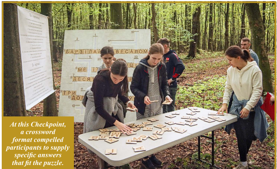
At this Checkpoint, a crossword format compelled participants to supply specific answers that fit the puzzle.