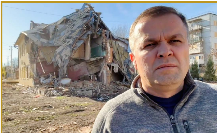
As BIEM personnel distribute aid and minister along the war zone, destroyed homes are a common sight.