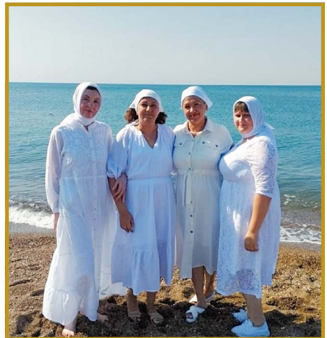
In Western Asia, these new believers traveled to the Mediterranean Sea to be baptized. Praise God for saving souls!