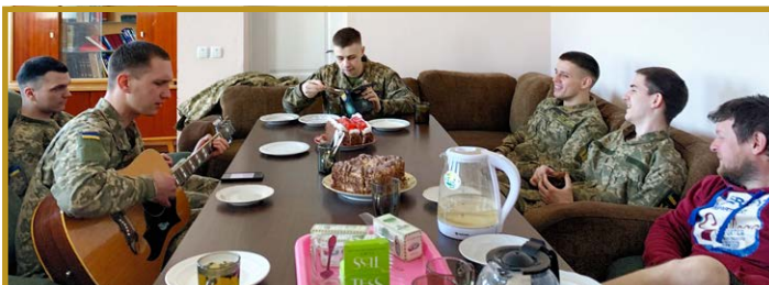
The church in Desna, Ukraine, is ideally situated to reach out to soldiers at the nearby military base. May God bring more salvation decisions among them!