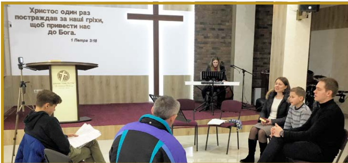
In Ternopil, Ukraine, dividing the church into small groups allows a cautious approach to in-person worship.