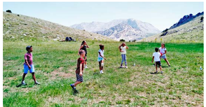
In some lands, children come with confusing ideas about Allah and Muslim culture. But each day they opened more to God's Word and learned of Christ. WESTERN ASIA