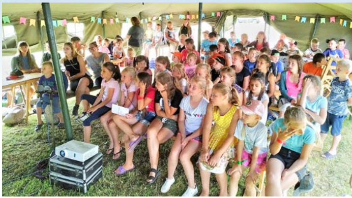
In Popina, this tent outside the church generated excitement and provided a shady spot for services. BELARUS