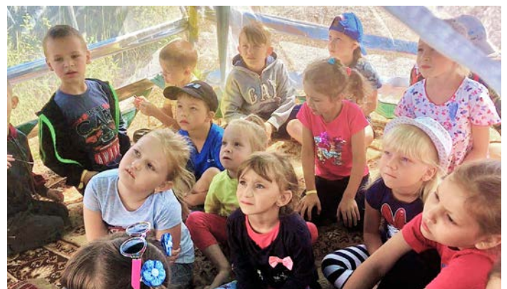
Teaching little ones their very first lessons about God—what an awesome opportunity! UKRAINE