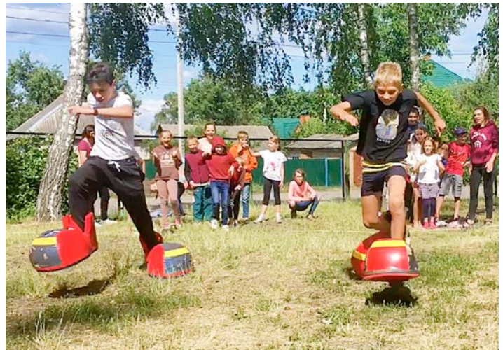
Nothing livens up game time like wacky relay races! UKRAINE