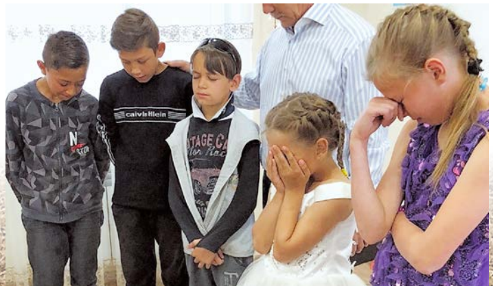
These campers responded to God’s Word. They came forward to repent of sin and ask Christ to save them. RUSSIA

Thank you very much for your financial blessing, that I could help such kids at least a little bit and have a share in their difficult lives. ”