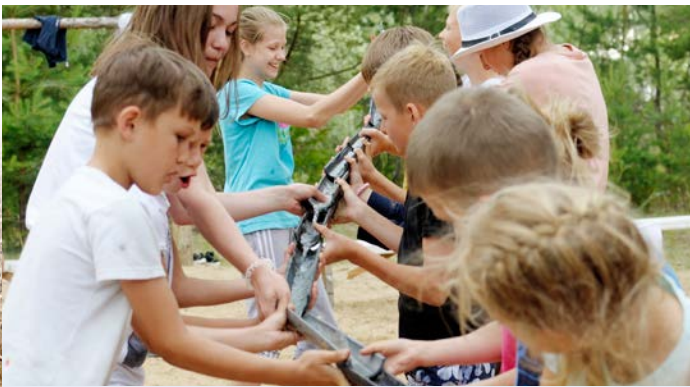
In this competition, teams created water channels and tried to collect the most water. Easier said than done when the channel is made of short segments held by hand! RUSSIA

“ WESTERN ASIA – Many of these children were closed at first; they weren't open to fellowship. They spoke from their juvenile understanding of Allah like God and about Muslim culture. But with each day they became more friendly and talkative. They learned about the loving Lord Christ, and He opened their hearts and persuaded them through the Word of God, and through the adults' testimonies. Through us, the Lord sowed in them and led their hearts toward repentance. Praise the Lord Jesus Christ for these children's souls. The kids began to pray to the Savior, to sing songs to Him and to read His Word. The peace of God and joy of the Lord filled their hearts. ”