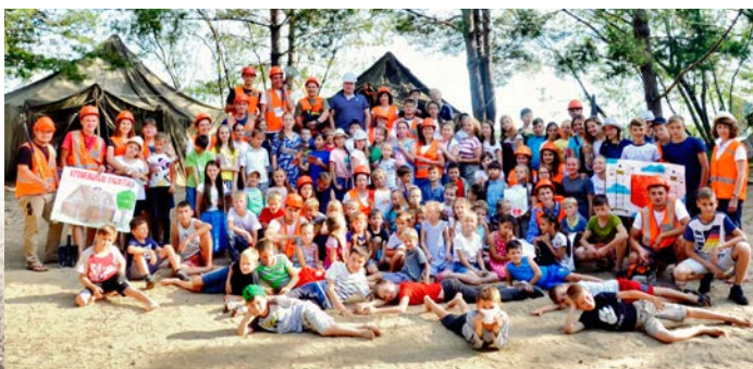
Construction was the theme of this camp. "Every day, we laid a brick in the wall we were building, and every brick stood for a passage of Scripture the children would learn that day." RUSSIA

“ Youth camp had the largest attendance this year overall; we had over 130 young people attend camp, from six different regions of Russia.... The theme of youth camp this year was "I Will Serve the Lord." Every morning at camp started with an hour of prayer and Bible study.... Every day after dinner, we would have a time of worship and preaching and answering questions around the fire, which lasted well into the night. The young people would stay up to discuss Bible questions and fellowship. To our surprise and encouragement, however, the youth were always up and ready for the next day to start and were waiting for morning Bible hour to start at 8 a.m. ”