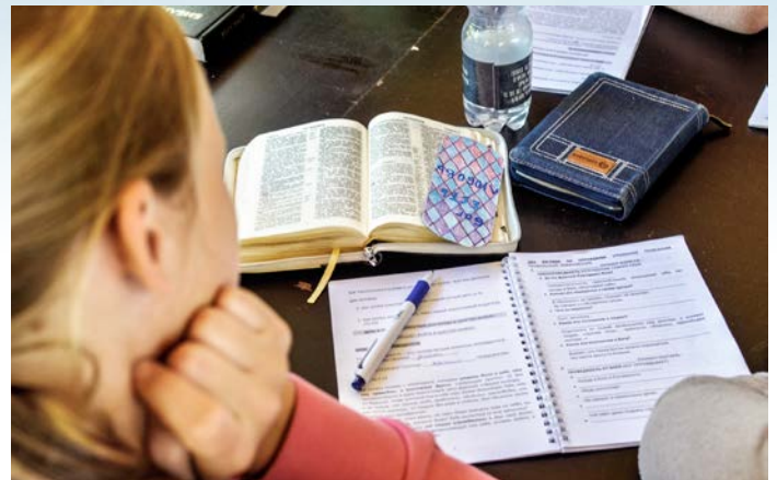
Some Sunday school kids try to answer every question with "God" or "Jesus" or "the Bible." But when they learn to dig into God's Word for truth, they learn a valuable skill. UKRAINE