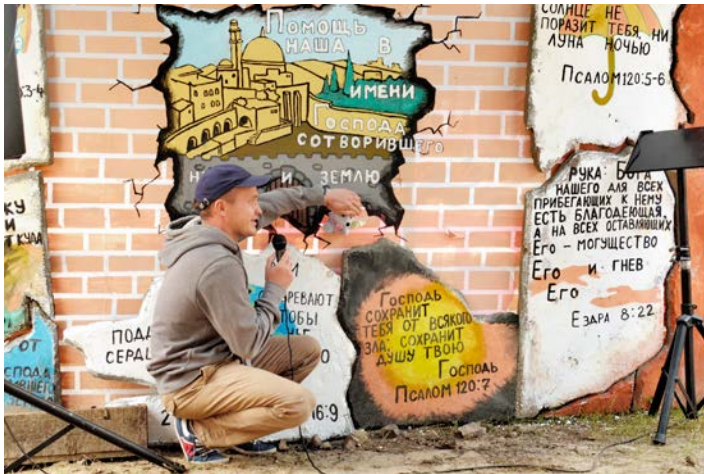
Camp speakers use the services to teach valuable truths from God’s Word. RUSSIA

handcrafts—all with adult leaders who reflect God’s love for them. We can’t thank you enough for your prayers and donations to make summer camps possible, but let us share quick peeks at some of the camps. This year, combined reports indicate 1,019 souls repented of sin and accepted Christ as Savior!