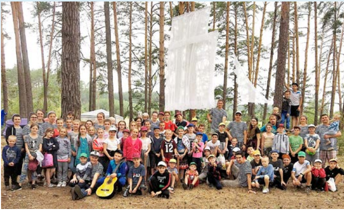
In Smiga, the camp had a sailing theme, so each Bible lesson involved the sea (Christ calming the sea, the great catch of fish, etc.) UKRAINE