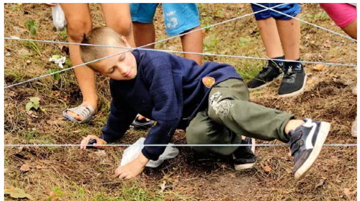
Games can teach, too! Just as believers learn to steer clear of sin, this course encourages kids to pass without touching the obstacles. UKRAINE