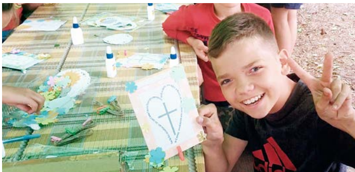
Making handicrafts engages both minds and hands. This craft includes the camp's theme verse, John 3:16. UKRAINE