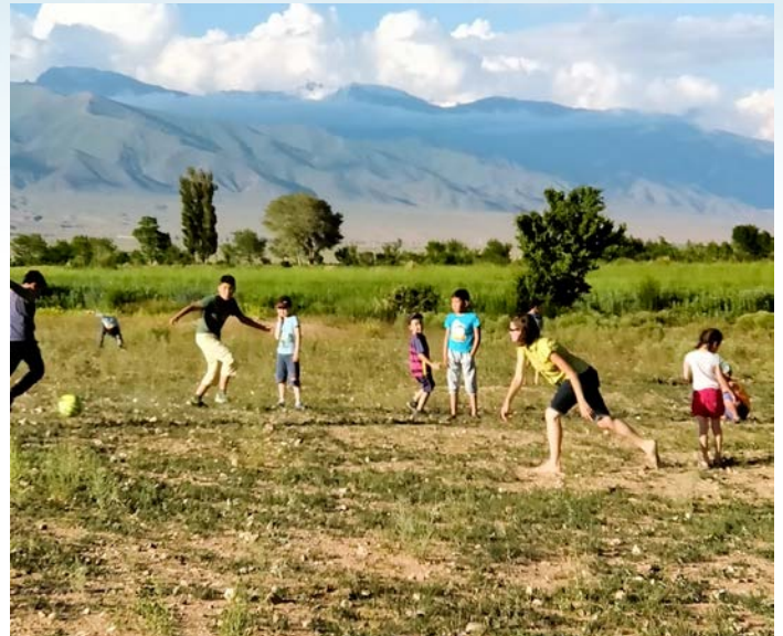
Holding camps in Muslim lands can invite trouble, but our workers do it. Praise God, a number of young souls accepted Christ this summer! CENTRAL ASIA