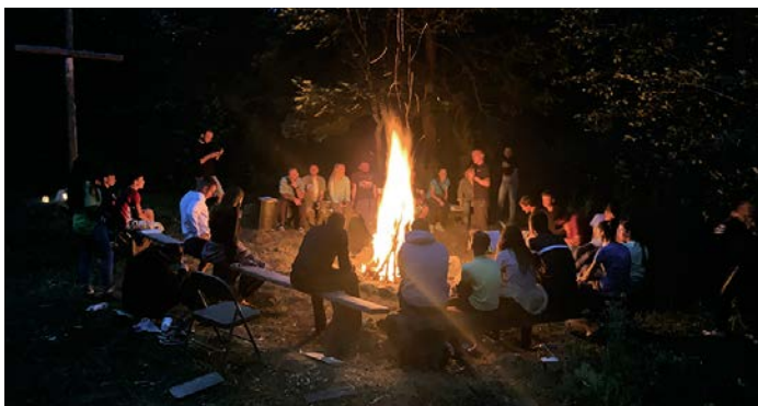
With their Extreme Christian Camp, the church in Ternopil invites young adults to a time of camping, river rafting, and hiking in the Carpathian Mountains. Like all camps, the main goal is evangelism. UKRAINE